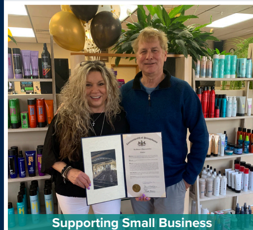
Supporting Small Business