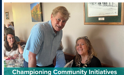
Championing Community Initiatives