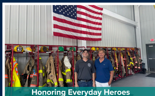
Honoring Everyday Heroes