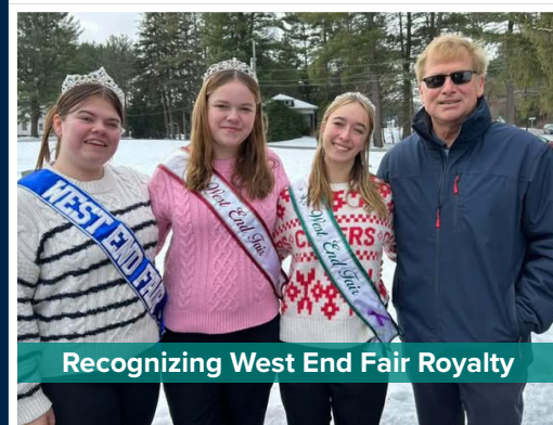
Recognizing West End Fair Royalty